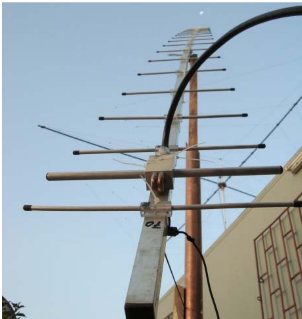
5N0EME 70 cm yagi pointed to Moon