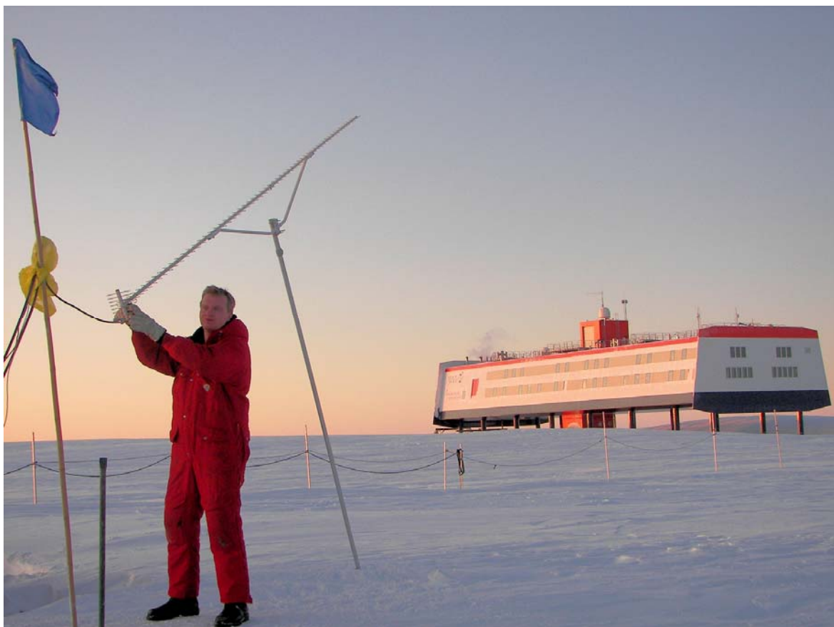
DP1POL – Felix & 67 el yagi. It is winter at the South pole!

Most hams think it takes a big antennas and high power to work EME. This talk will focus on 1296 and 432 and try to change this impression by showing examples of how little it take to make QSOs off the Moon.