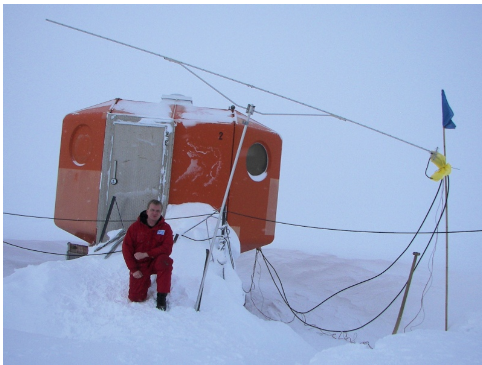
Felix operating location.