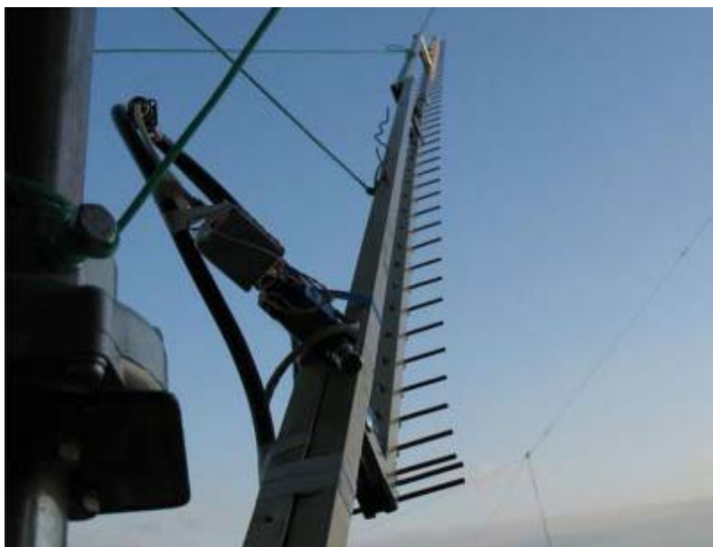
RA0ACM's single yagi used on 23 cm EME aimed a Moon

Sergey in NO76 is QRV on 23 cm using a single 49 el yagi, 75 W from 2 x RA18H1213G SSPA, G4DDK LNA, DB6NT transverter/TS-2000. During the ARI Digital EME Contest he worked OK1DFC (22DB/26DB) on JT65c.