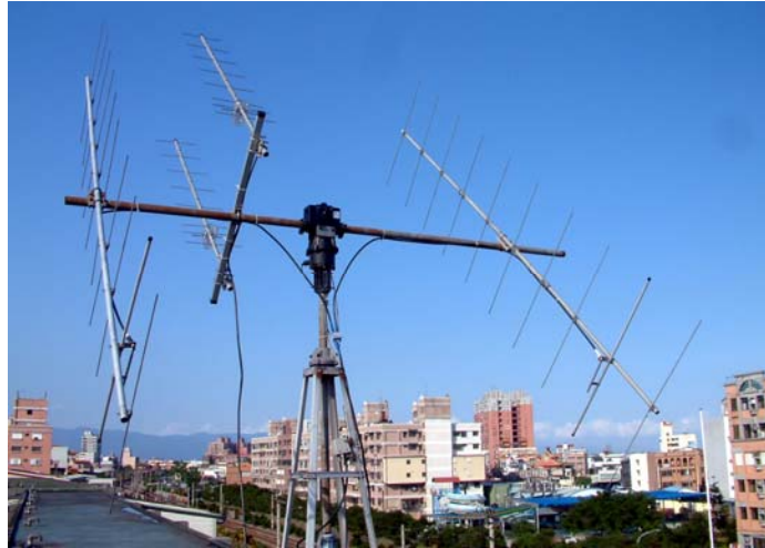
BX1AD 2 yagi array used on 70 cm EME