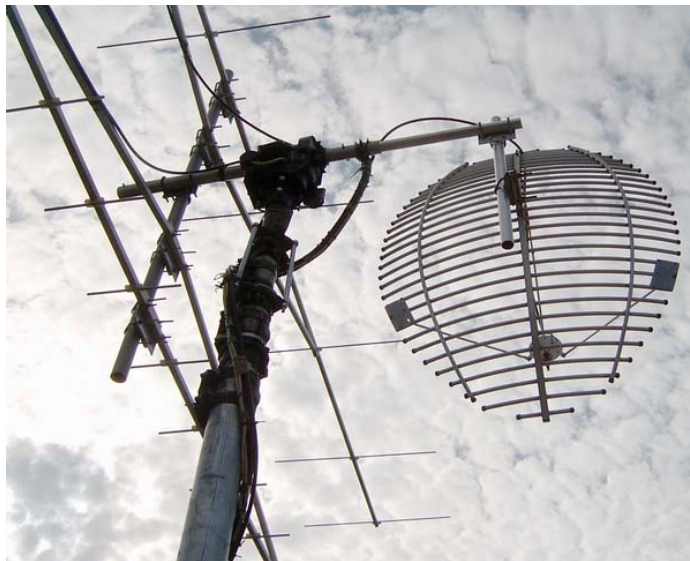
OK1TEH's antennas including dish used on 23 cm EME

UA9FAD is now QRV on 1296 EME using a 1.2 m dish with 0.25 f/d and linear pol with 120 W at the feed. He has thus far completed 23 cm QSOs with OK1KIR, G4CCH and K2UYH on JT65c and possibly more.